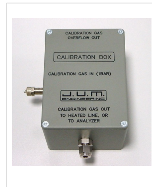
Optional Calibration Box is already set to 1 bar Cal. Gas Inlet Pressure