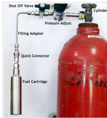
Hydrogen Fuel Purifier Cartridge Shown with master cylinder and optional filling adapter