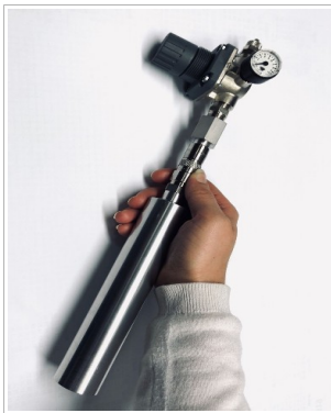
Optional Hydrogen Fuel Purifier and storage Cartridge (Metal Hydride)